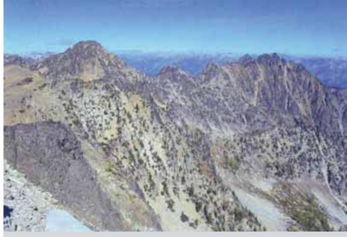
Looking north from ~8,000 feet elevation to Square Top Mountain. One can see why this region is considered more of a National Rock Pile than a National Forest!

True, quite a few youngsters went up on the stations with little knowledge of what they were getting into and found it anything but a rewarding experience, as demonstrated by various horror stories in Ray Kresek's book. But for a lot of us, I'm sure the majority, the stations provided the space we desired. Probably there weren't many who were as determinedly seeking the 'highest and the bestest' as I was-