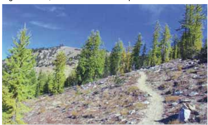
The trail up the mountain is still in great shape after 60 years with no maintenance. We are on the final grade switchbacking up the west side of Pyramid through Alpine Larch glades.

In those days, the friendly lookout building was waiting and each time one looked up it was closer. About halfway up the bare slope a shallow gully held the snowbank mentioned earlier which lingered through most summers. Other than this, the south and west sides of the mountain are completely bare, lichen-blackened, frost-heaved, reddish granite slabs. To make a trail suitable for pack animals, these stones had been lifted out and by filling in the holes with smaller fragments a semblance of a smooth bed was attained. This was worked by the lookouts as a way to get exercise until that trail was manicured into something of which to be proud. In places where the fragments of scab rock were particularly big, the trail was a regular trench, three or more feet deep.