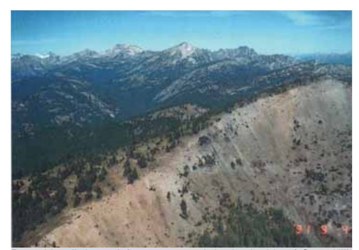
Pyramid trail, lower left, goes around the back side of Crow Hill, foreground, descends into Corral Creek Basin, then ascends Graham and Albicaulis Mountains before the final climb to the summit.

Crow Hill and then held that altitude to the next up grade at Graham Mountain. Much of the big hike up over this mountain could have been avoided completely. Instead, the route climbs about six hundred feet to the next meadow area then drops most of it again into (west) Corral Creek. One more mountain must be crossed, the one I call 'Albicaulis'. It may be that this climb was unavoidable due to bedrock outcrops. Of the three ascents before the final one, it is the easiest and most reasonable. In any case, it brings one to the foot of Pyramid; the bare scab rock slope then leads directly to the summit, although the trail switchbacks up the west side on a continuous, sensible grade.