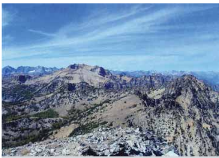
View NW from Pyramid Mountain to Square Top (right), Cardinal Peak, (center), Mt Maud, 7 Fingered Jack and Mt. Fernow (in distance, left). During the Pleistocene, a 90 mile long glacier filled the Chelan and Stehekin valleys and only the highest peaks, such as those shown here, rose above its surface.

mountain goats that had visited Pyramid that second night made it their home. To get there and back by the fastest of scrambles would take at least three hours, which was about the maximum I could absent myself from the station. So, the next opportunity was devoted to this. I don't recall how long it did take but I'm sure it must have been more than that amount of time. Whatever, it proved more than just interesting - it was fascinating. Not only did I see the goats, but 'discovered' two glaciers. The first of these almost led to my undoing.