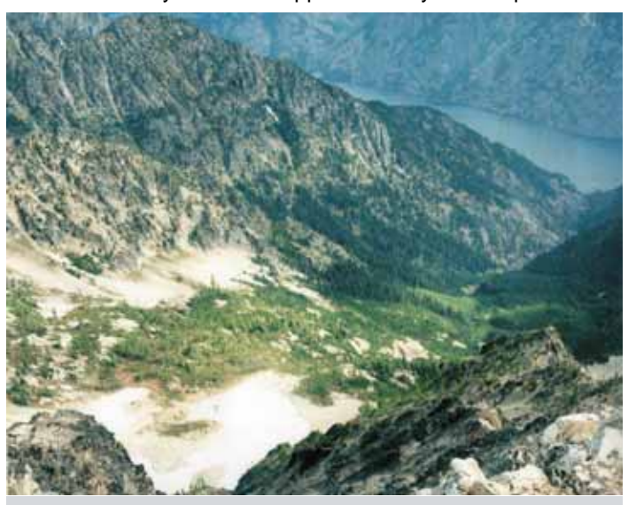
Looking down Pyramid Creek 7,245' to Lake Chelan from Pyramid Mountain. As if this is not remarkable enough, the lake is over 1,400 feet deep of which 400 feet is below sea level!

Perhaps to persons living in such high altitude states as Colorado, Utah or Wyoming, Pyramid's 8,245-foot altitude may not seem very impressive. To these let me say this: a mountain's real height is from its base rather than from sea level. In most Rocky Mountain states, the mountains rise from plains or valleys already 5,000 to 9,000 feet above the sea, which in any case is hundreds of miles distant. So, a 14,000-foot peak is seldom more than a mile or so above its base, and not many of them rise sheer for much of that distance. Compare this with the Northern Rockies such as Glacier National Park, or the North Cascades, and a tremendous difference will be apparant; the latter mountains are far rougher and are even higher from base to crest, despite the fact the altitude isn't nearly as great. But, even among these, Pyramid's rise in three miles of over 7,000 feet from the surface of Lake Chelan is remarkable. And this isn't counting the total relief. The lake is over 1,400 feet deep at that point! With such numbers in mind, those who have not seen this country can better appreciate why it is so spectacular.