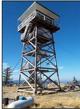
Big Creek Baldy LO