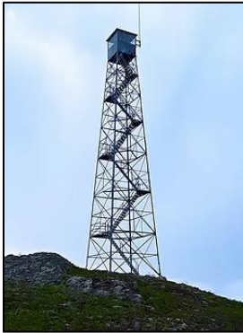
Blue Mountain LO