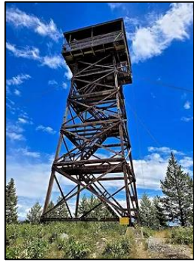
Big Sweede LO